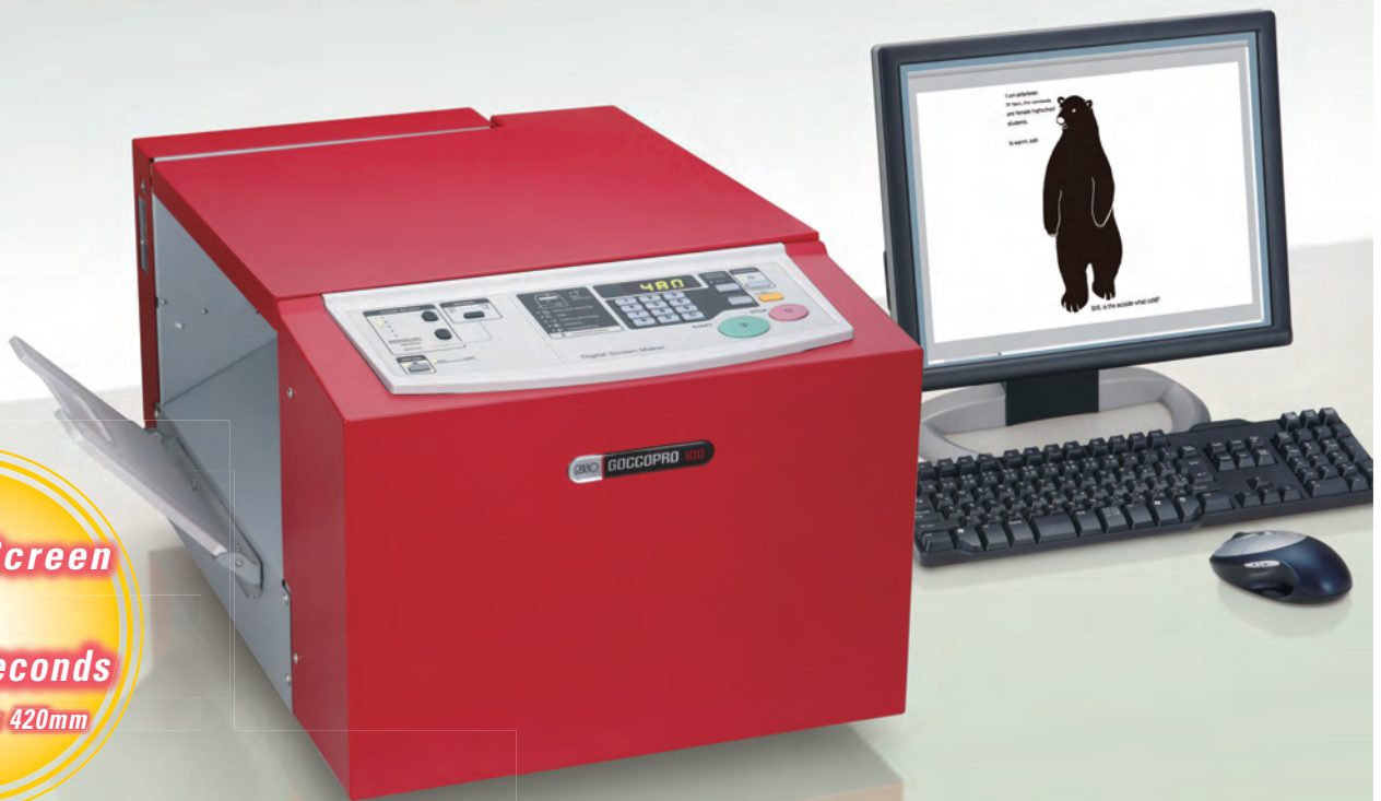
Image to Screen

NO Chemicals NO Emulsions NO Darkroom NO Water NO Film Positives